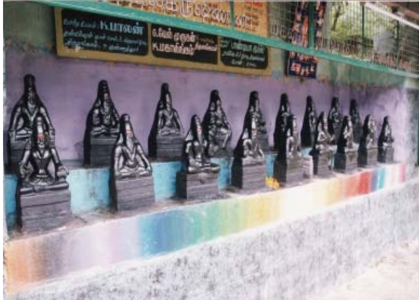
Statue of the 18 Siddhas at a temple in the town of Cittargiri. Shiva Goraksha Babaji, leader of the Siddhas, is at the centre with flowers placed at the base of the pedestal.

Going in search of Babaji Nagraj, we approached the small town of Cittargiri, a town aptly named for its legacy of the South Indian eighteen Cittar or Siddha tradition. (Siddhas in South India are known as Cittars .) There we saw the statues of the eighteen Tamil Cittars but we did not find any statue nor any mention of Babaji Nagraj. However, in the middle of the eighteen Cittars there was one Cittar at whose feet flowers were laid, distinguishing him as their leader and guru. This figure was Shiva Goraksha Babaji who, as we were told by the pujari of the temple, brought Yogic knowledge from the North of India to the South, along with the Rishis Agastya and Sunder Nath of the Himalayas.