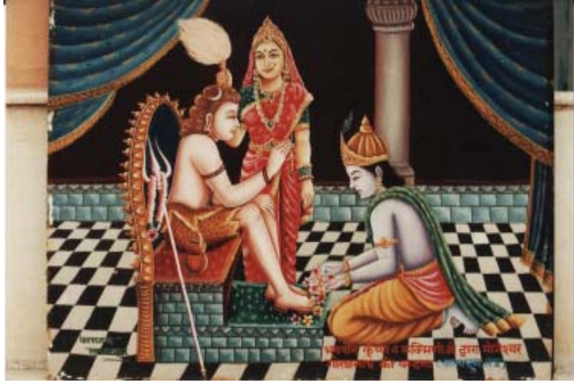
Lord Krishna worshipping Shiva Goraksha Babaji

be performed for Goraksha Nath. Visualize his image in your heart, for this type of meditation will give you the siddhis and all spiritual powers for self-realization.”